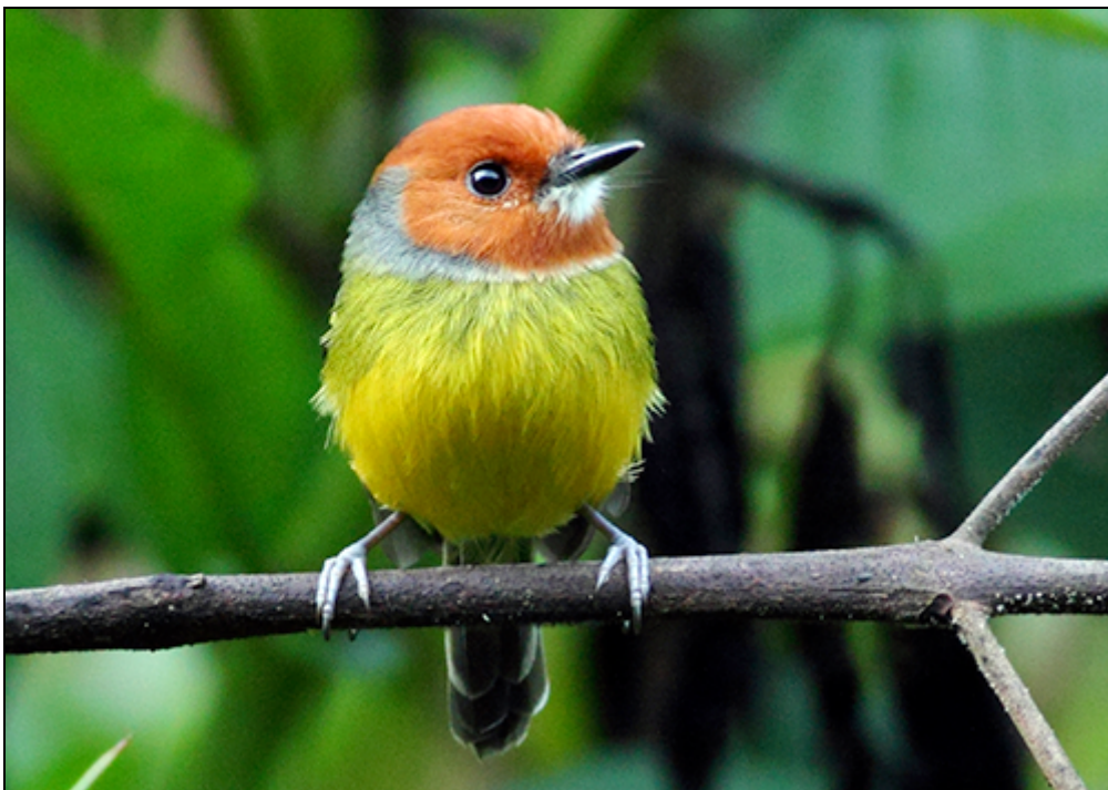
Lulu's Tody-tyrant

Overnight at Abra Patricia Long whiskered Owlet Biological Station. B, L, D.