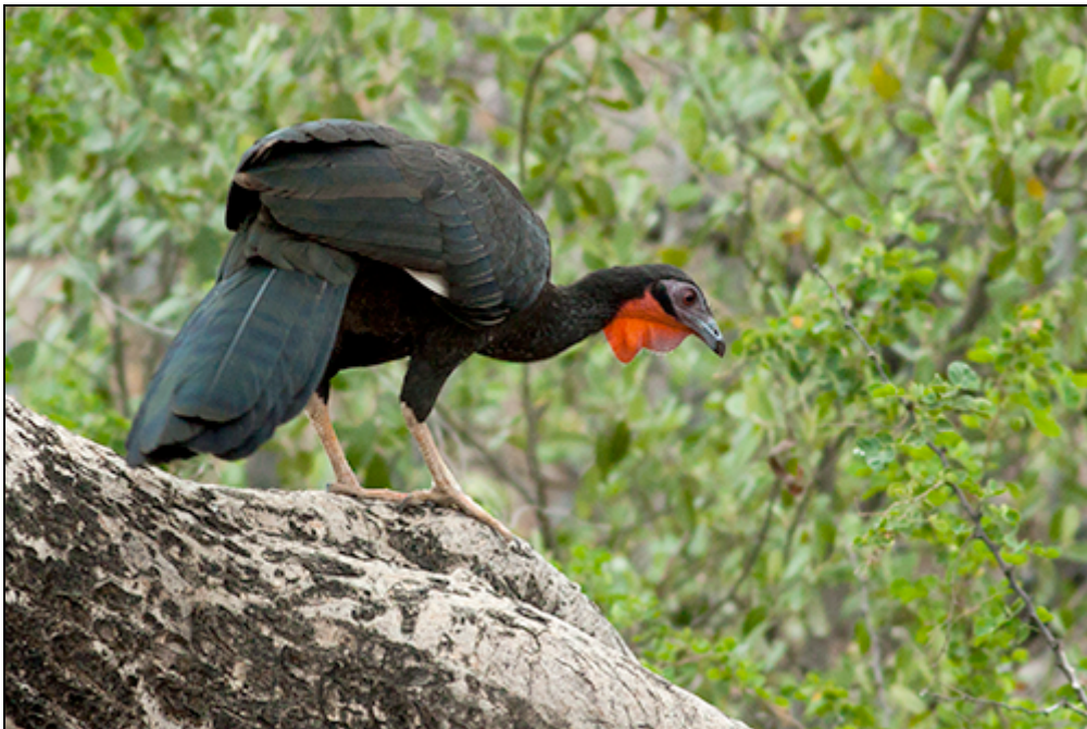
White-winged Guan