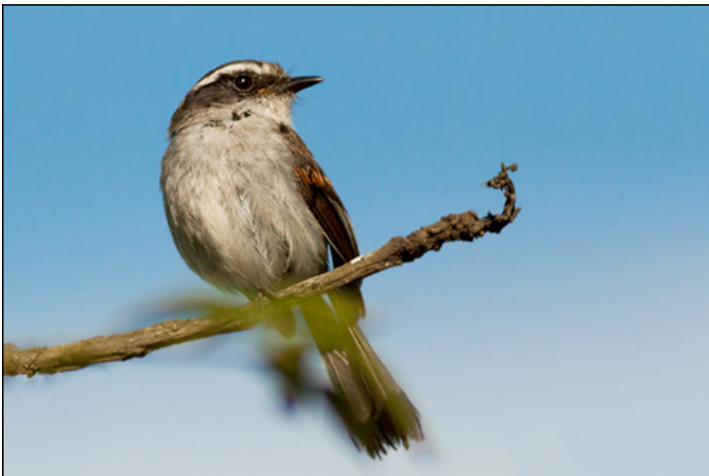
Piura Chat Tyrant