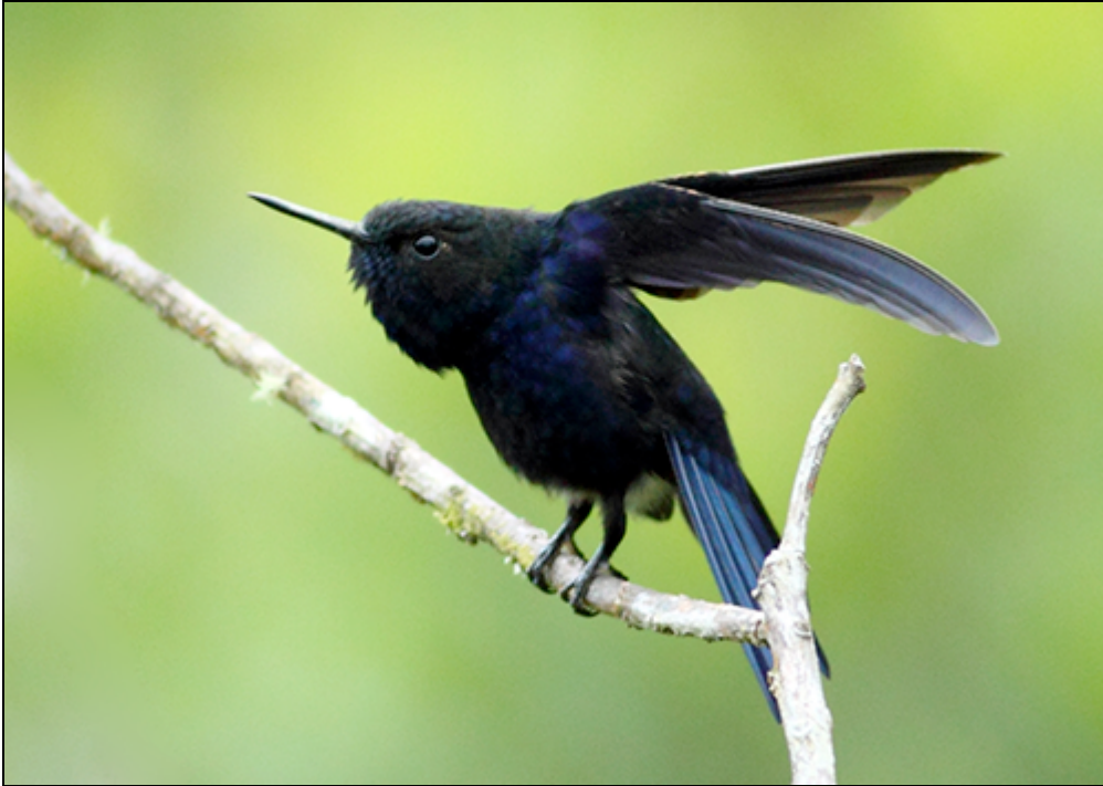
Royal Sunangel