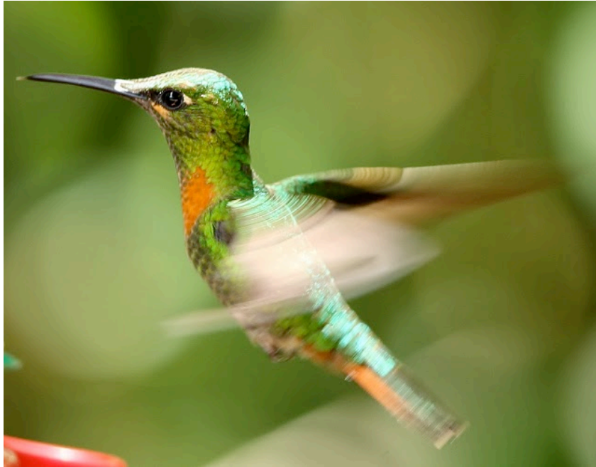
Gould’s Jewelfront

Today we have the first hours of the morning to explore Cerro “La Escalera” Reserve located at 30 minutes from the city. Here we will concentrate our search in some specialties like Plumbeous Euphonia , Dotted Tanager and Koepcke’s Hermit , after a few hours on this spectacular spot we will be visit the new Hummingbird station where we can add some more species like Black-throated Brilliant , Gould’s Jewelfront . After lunch we will head to the airport for our domestic Flight Tarapoto – Lima.