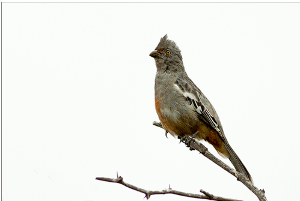
Peruvian Plantcutter