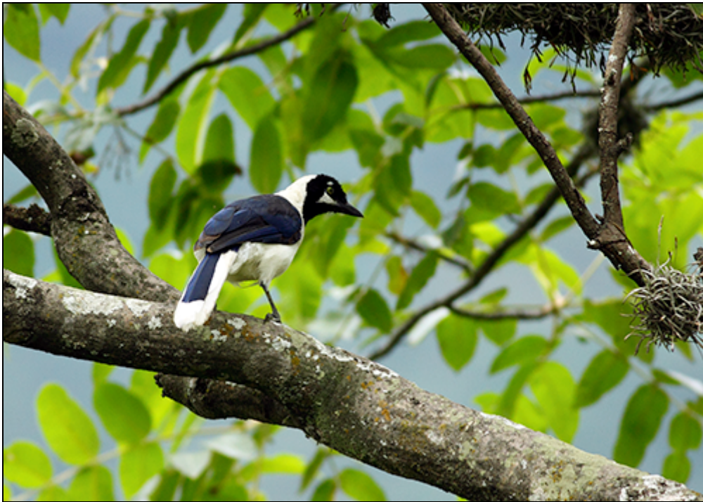
White-tailed Jay