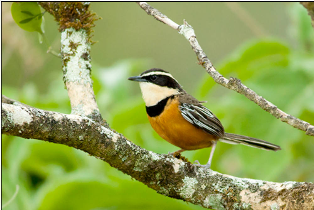
Marañon Crescentchest

Overnight at Abra Patricia Long-whiskered Owlet Biological Station. B, L, D.